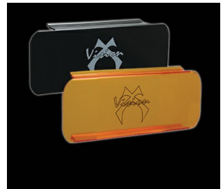
PCV-P12BL Shown PCV-P12Y Shown Features

Polycarbonate covers help protect against rocks and oncoming debris as well as increased visibility in fog. With easy snap on installation.