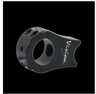
XIL-B175 (45mm) Shown Features

TUBE MOUNTS Machined Billet Clamps fit all Xmitter Series Light Bars for tubed frame or chassis mounting.